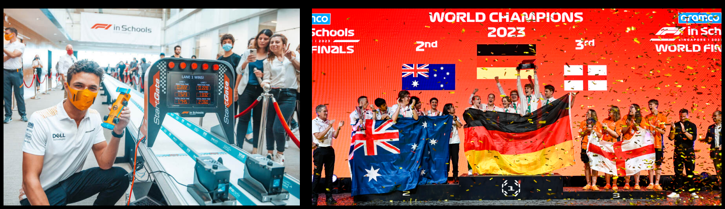
LANDO NORRIS AT F1 IN SCHOOLS FINAL

The 2024/2025 F1 in Schools Competition will progress through three stages: Regionals, Nationals, and World. Each stage will be more demanding than the last and give the opportunity to proceed in the competition.